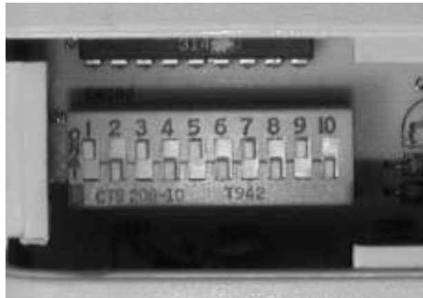
RECEIVER CODE SWITCH

c. p. ALLSTAR Corporation 443 Boot Road Downingtown, PA 19335